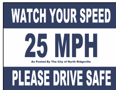
DESIGN 1 - $15.00

Below are the current signs approved by the Homeowners Association Board of Directors. If you are interested one of the signs below, please send an email to info@hamptonplace.org with your name and address. Someone will then contact you to place the order.