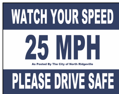
DESIGN 1 - $15.00

Below are the current signs approved by the Homeowners Association Board of Directors. If you are interested one of the signs below, please send an email to info@hamptonplace.org with your name and address. Someone will then contact you to place the order.